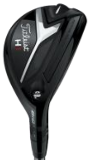
Titleist 818 H1 $199 at TGW.com