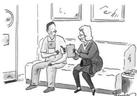
"And if the golf area of the brain was somehow destroyed, there might be a little something extra in it for you."