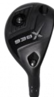
SUB70 939X $129.00 best value