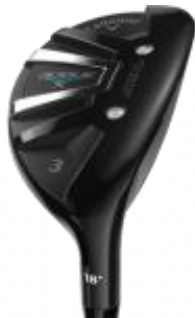
Callaway Rouge X $189.99 on sale