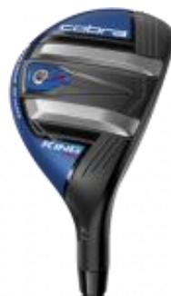
Cobra King F9 $219.00 on sale