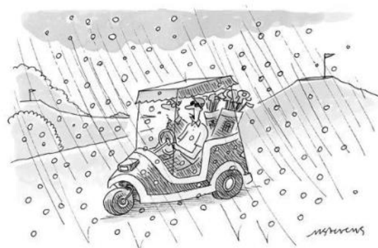
"Oh, no! Golf-ball-sized hail!"